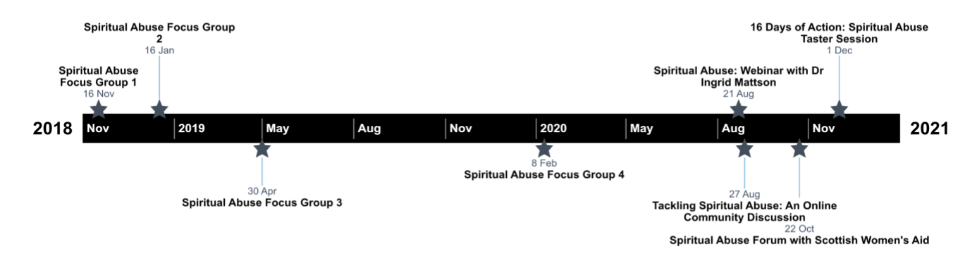
Fig.1: Timeline of Spiritual Abuse events at AMINA MWRC

Amina MWRC has facilitated a number of very successful events (see Figure 1 below) which have not only created spaces for women, community members and advocates to discuss the manifestation of Spiritual Abuse, but have also indirectly provided an arena where experiences are understood and upheld.